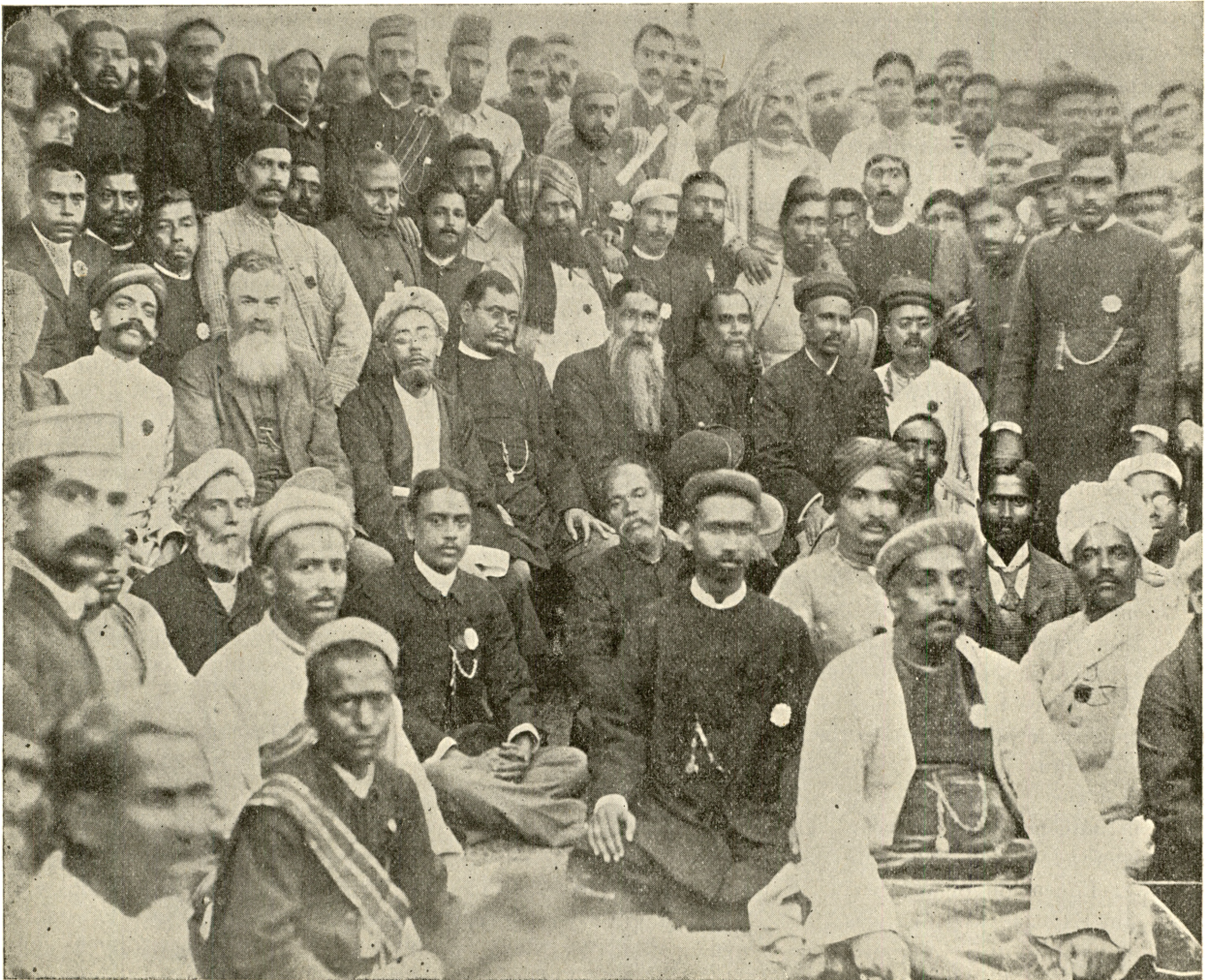
GROUP FROM THE INDIAN CONGRESS, CALCUTTA, INDIA.

Of that meeting an Indian writer said: “In the history of a nation there is always a day which is marked above all the rest, which sows the first seeds of progress, and which lays the foundation of all future greatness. Such was the day when the patriotic barons of England assembled on the little island of Runnymede to induce their king to sign their great charter of freedom. Such